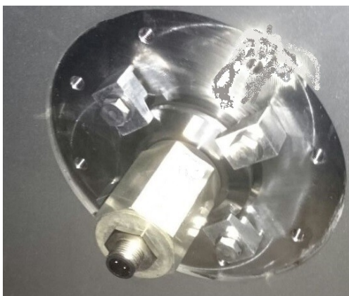
Filter mit Spannpratzen